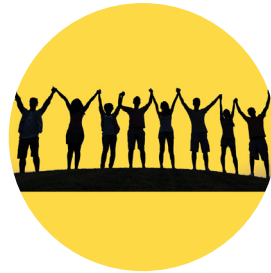
A COMMUNAL SPIRIT